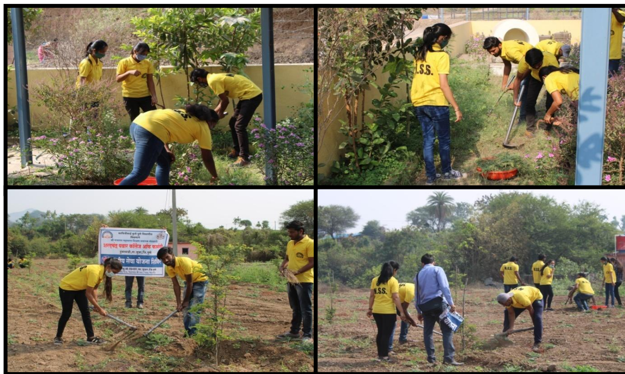
Tree plantation and Cleaning at village

25 NSS volunteers of SPCOP College of Pharmacy, Otur cleaned the Graveyard premises, School, Mandir, Grampanchyat, High school at Dingore Village and plantation was done on same day on 18 th March 2021 . The program was jointly carried out with the village people. The principal and few faculty members also joined the campaign.