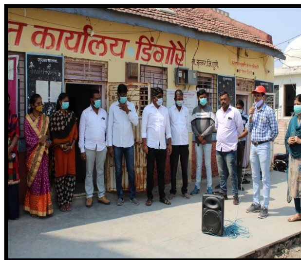
Inauguration program at Dingore camp 2020-21