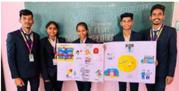
D. Pharmacy Students received the first rank at slogan competition organized by Samarth Institute of Pharmacy, Belhe, Pune